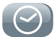
Timer (24 hours)