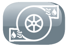
Integrated permanent water drainage pump